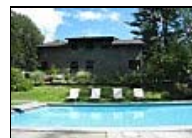
John Leguizamo's lakefront retreat