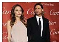
Palm Springs Film Fest Awards Gala