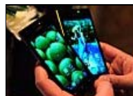
Photos: Highlights from today's CES