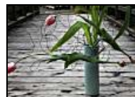
Japanese Tea Garden. Spotswood