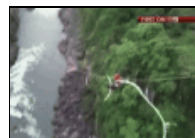
Tourist survives after bungee snaps